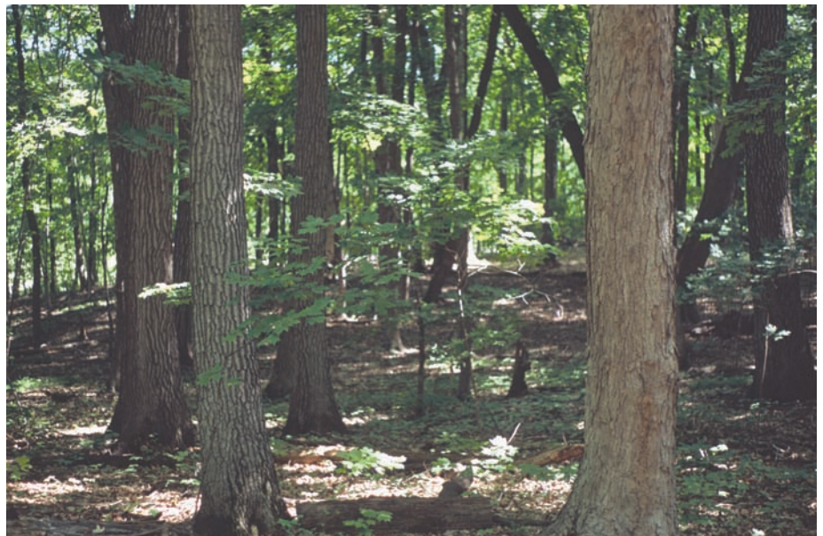
Fig. 1. The Big Woods (Minnesota) landscape, dominated by mesic forest, was savanna and prairie until about 1300 C.E., when droughts and consequent fine-fuel reduction led to reduction of surface fires, allowing tree invasion and expansion (27).

Paleoecological and paleoenvironmental records spanning the last 10,000 to 20,000 years are now available for much of the globe, most densely in glaciated terrain but also in many other regions (21, 22). These records provide important perspectives for restoration, not all of them comforting. First, environmental and ecological changes are normal; perhaps the most natural feature of the world in which we find ourselves is its continual flux. The past 20,000 years witnessed a transition from a glacial to an interglacial world, with numerous climatic excursions throughout. Few major terrestrial ecosystems have existed in situ for more than the past 12,000 years (23, 24), and most are considerably younger, some arising only within the past few centuries (24). Every terrestrial locale has been occupied by a series of ecosystems—often contrasting in structure and function—since the