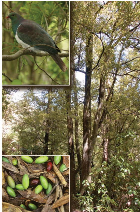
Fig. 1. Forest canopy trees such as Beilschmiedia tawa are dependent on kereru ( H. novaeseelandiae ) for dispersal of their large (>1.4 cm in diameter) fruits, because other potential dispersers are extinct or very rare. [Photos: D. Norton and A. McIntosh]

The need for intensive mammalian pest control in New Zealand is well supported by numerous examples contrasting the survival of indigenous biota in areas with and without such control (5). However, the impacts of animal pests may not be reversible, even when they are controlled to very low densities. For example, red deer ( Cervus elaphus scoticus ) are widely dispersed through native forests and have a strong negative influence on